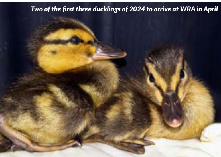
Two of the first three ducklings of 2024 to arrive at WRA in April

Mallards typically lay up to 12-13 eggs in a clutch, and one egg a day, so this will take up to 12-13 days. She will not start incubating her eggs (laying on them) until all eggs are laid, so finding a nest with only three or four eggs and no mother duck does not mean that the nest is abandoned. Mallard eggs are unmarked and creamy in colour to grayish or greenish buff. If something happens to an unfinished clutch of eggs, Mallard hens will make another attempt until they raise a successful brood. Once all eggs are laid, she will rarely leave the nest apart from short breaks to feed and stretch her legs. About 28 days later the eggs hatch together. This takes about 24 hours.