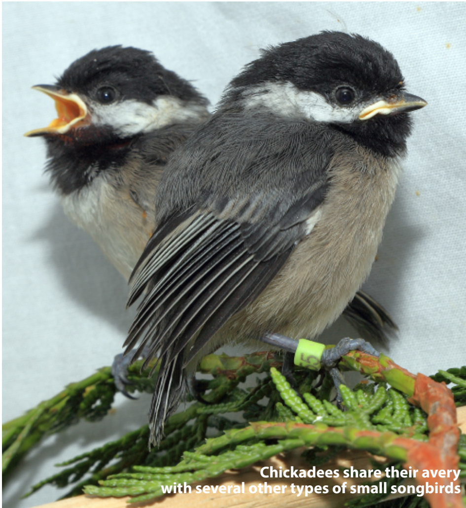
Chickadees share their avary with several other types of small songbirds