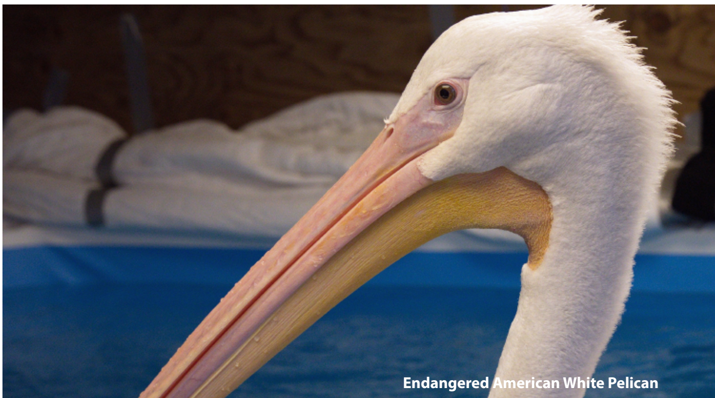
Endangered American White Pelican