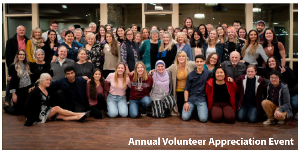
Annual Volunteer Appreciation Event