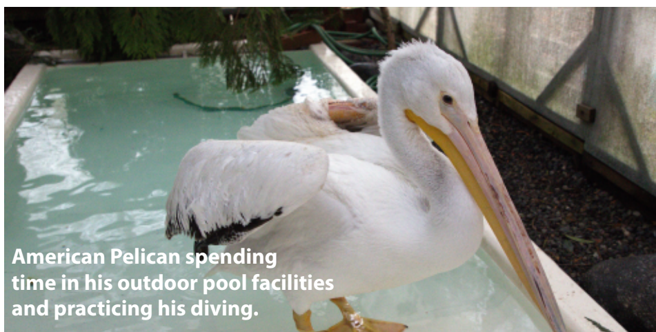
American Pelican spending time in his outdoor pool facilities and practicing his diving.

Since the organization began, Wildlife Rescue has treated over 125,000 patients and continues to provide leadership, education and consistently high standards of care in wildlife rehabilitation. Positive outcomes and success continue to be possible due to the strong collaborative network, support and generosity of volunteers, staff, businesses, donors and sponsors. Thank you!