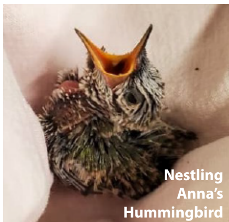
Nestling Anna's Hummingbird

Please join our team of SUSTAINERS who are saving lives everyday.