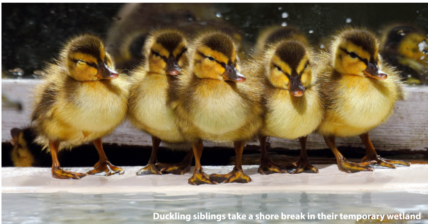
Duckling siblings take a shore break in their temporary wetland