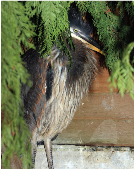
One of our long-stay patients tries to avoid the limelight during a 40-day stay.

the WRA continues to host more long-stay patients. With the experience and expertise we have, we are able to treat a wider range of animals and provide more treatment options. We also successfully treat and release animals that would not have previously survived.