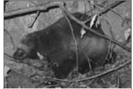
Wolverine just prior to release

Although this Wolverine did not experience a long life in the Lower Mainland's backcountry, it did survive a full season in its natural habitat. With as few as 1000 male Wolverines remaining in BC, we hope