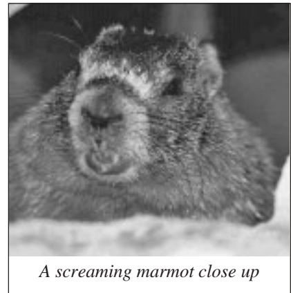
A screaming marmot close up

animals that we admit each year has given me a sense of their habits and characteristics and is a big help in creating interesting photographs.