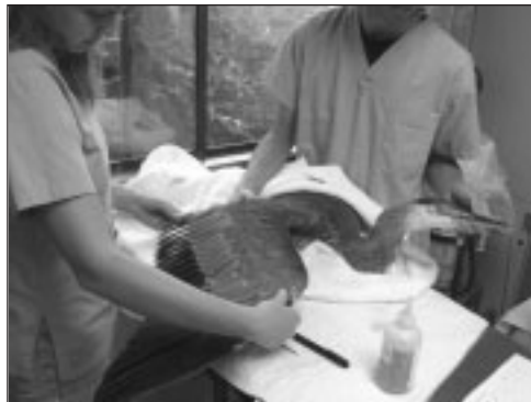
Care Centre staff examining an injured Great Blue Heron

The definition of rehabilitation is to 'restore to normal activity in good condition.' For a wild animal, this includes the ability to function fully in its own environment, to be able to locate and utilize appropriate food sources, to be able to recognize and avoid predators, and to be able to recognize and interact with others of its own kind. Ensuring an animal has attained this state is no easy task.