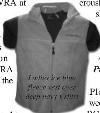
Ladies ice blue fleece vest over deep navy t-shirt

This fall we are offering comfy fleece vests and 100% cotton t-shirts with our WRA logo embroidered on the upper left side.