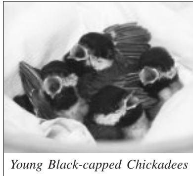
Young Black-capped Chickadees

One of my first, and favourite, photos is of these orphaned, young, Black-capped Chickadees. The Foster Fur and Feathers Program began using my pictures right away and you'll