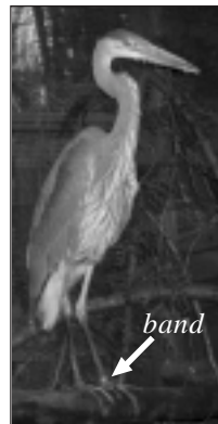
Banded Great Blue Heron

essary data (ie. proper ID, age, sex, and measurements). The application of the band to a bird denotes the end of its stay at the care centre, but more importantly marks a new beginning - a second chance at life in the wild. I usually take a moment to reflect on the countless hours of hard work put in by volunteers and staff to get the animal to this stage, wish it the best of luck, and bid my final farewell.