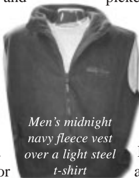
Men's midnight navy fleece vest over a light steel t-shirt

are also by Ash City and come in glacier blue or midnight navy. Sizes: s, m, l, xl & xxl. Price: $55 +pst